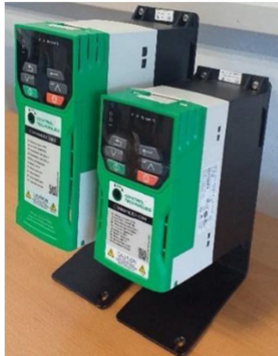
Frame sizes 1 and 2 front and side views